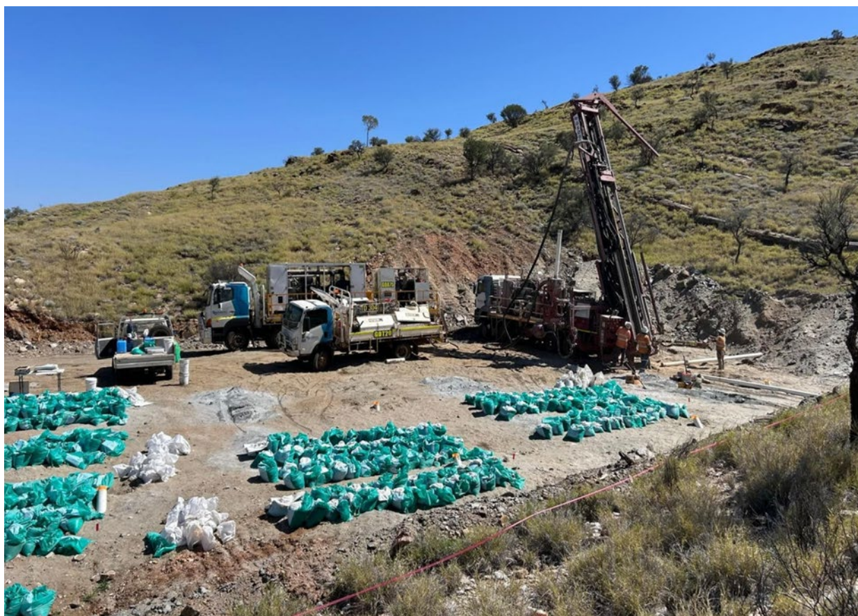
Figure 1: Reverse circulation drill rig at Harts Range Cusp Prospect