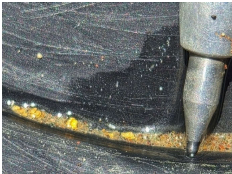
Figure 1. Visible gold panned from rock chips in previously reported Amy Clarke aircore hole 25ACAC007 from 11-12m which recorded an assay of 23.9 g/t gold from 10-12m downhole (scribe pen used for scale) 1 . Refer to GSN ASX announcement dated 6 November 2025.