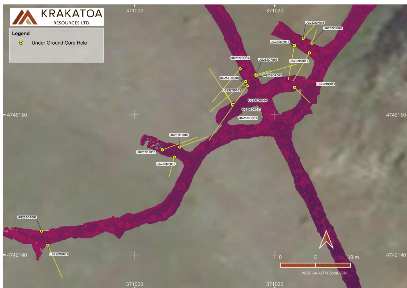
Figure 1 Plan view showing the locations of the underground core sampling drill holes in relation to the adit. LiDAR surface profile.

The Company undertook this work with a modified 41mm “Shaw Portable Coring Drill” kit which is ideal for conducting shallow (up to 20m) core drilling in confined spaces. This drilling will test the antimony mineralisation system and the expansive margins for the presence of gold.