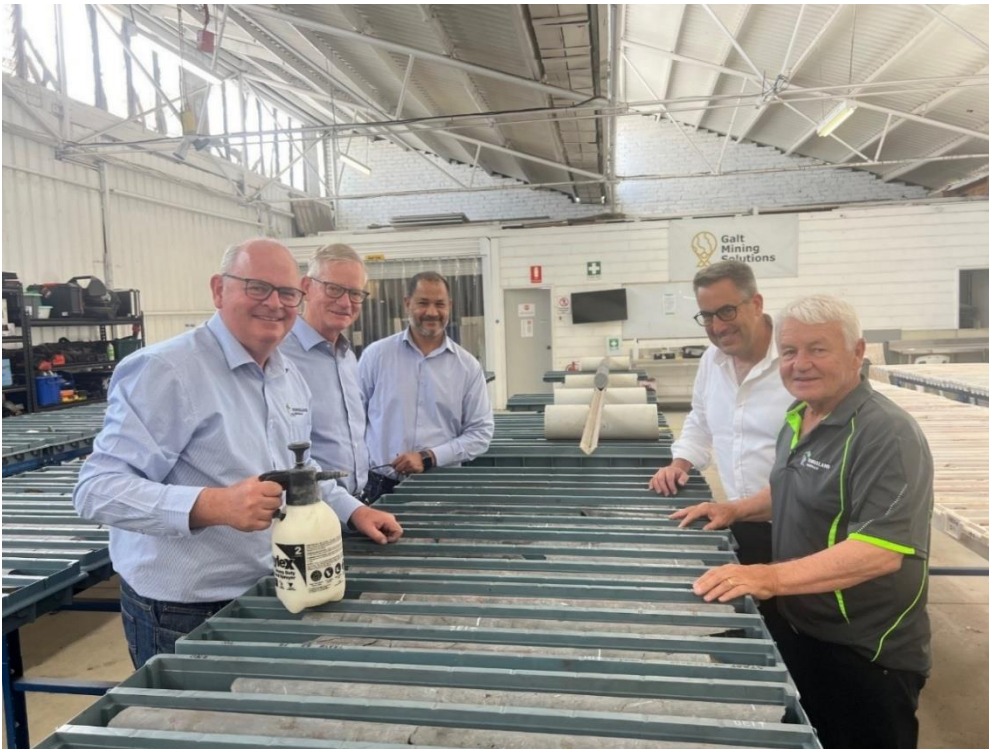
Figure 1: Kingsland Board of Directors inspecting Leliyn drill core at the Galt Mining Solutions facility in West Leederville, Perth

A recent drilling program of PQ size core (85mm diameter) was completed and the core transported to Perth (Figure 1). A total of three holes for 379m were completed and were located within the scoping study pit design (Figure 2). This core is for metallurgical test work to refine the crushing, grinding and flotation parameters. Kingsland's consultants, Independent Metallurgical Operations (IMO) and GR Engineering Services (GRES), are working together to finalise the test program.