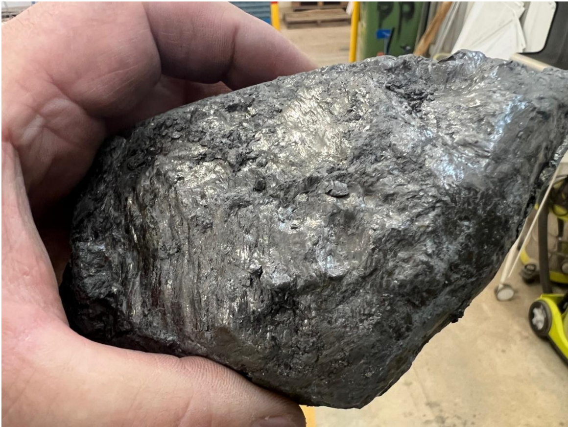
Figure 3: Sample of graphitic schist from LEM002 at 23.6m depth

Figure 3 shows a sample of graphitic schist from the recently drilled LEM002. This hole was collared within 10m of the previously reported LERC_56 that intersected 72m @ 9.21% TGC (from 0m) including 20m @ 13.14% TGC (from 25m). 3 This sample in Figure 3 is visually estimated to contain: