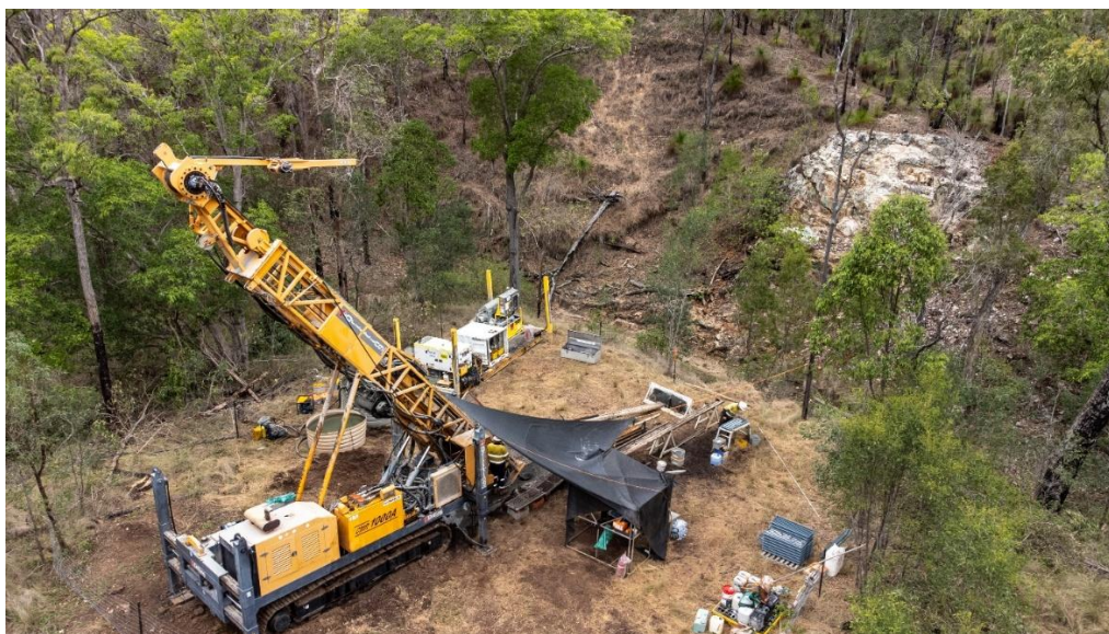
Figure 1 Drillhole 25BRD0038, November 2025

Managing Director, Grant Craighead, said: "We're very pleased with the progress at Briggs during 2025. We completed a positive Scoping Study outlining a potential large-scale, long-life copper mine and have commenced a Prefeasibility Study evaluating a conceptual 30Mtpa operation. The initial phase of this evaluation is seeking to enhance and expand the existing mineral resource estimate and we're off to a flying start with the latest drilling. We look forward to reporting the assay results over the coming months, followed by a recommencement of drilling around March 2026."