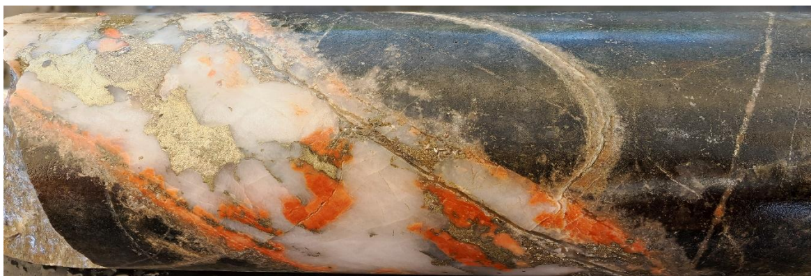
Figure 7 Coarse grained chalcopyrite (yellow) and pyrite (bronze colour) in quartz-feldspar vein cutting volcaniclastic sediments at 378.4m downhole depth 25BRD0038. From within a 14m wide interval visually estimated to contain 0.75% chalcopyrite (0.25% Cu*). Core diameter 50mm.

* DISCLAIMER: Visual estimates of mineral abundance and copper grade should never be considered a proxy or substitute for laboratory analysis where concentrations or grade are the factor of principal economic interest. Visual estimates also potentially provide no information regarding impurities or deleterious physical properties relevant to valuations. Laboratory assay results are required to determine the widths and grade of the visible mineralisation reported in preliminary geological logging. The Company will update the market when laboratory analytical results become available.