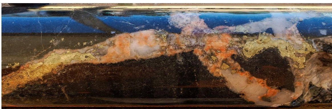
Figure 6 Multiphase quartz-feldspar-chalcopyrite-pyrite-anhydrite veins cutting volcaniclastic sediments at 336.0m down-hole depth in 25BRD0038. From within a 22.1m wide interval visually estimated to contain 0.75% chalcopyrite (0.25% Cu*). Core diameter 50mm.