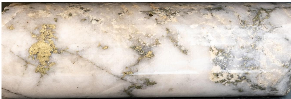
Figure 5 Magmatic quartz with blebby chalcopyrite (yellow) overprinting granodiorite porphyry at 55.8m down-hole depth in 25BRD0038. From within a 3.8m wide interval visually estimated to contain 1.5% chalcopyrite (0.50% Cu*). Core diameter 61mm.