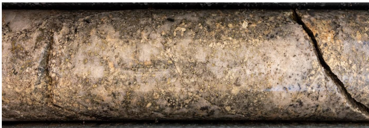
Figure 4 Altered granodiorite porphyry with silica flooding and disseminated chalcopyrite at 40.7m downhole depth in 25BRD0038. From within a 4.6m wide interval visually estimated to contain 2% chalcopyrite (0.70% Cu*). Core diameter 61mm.