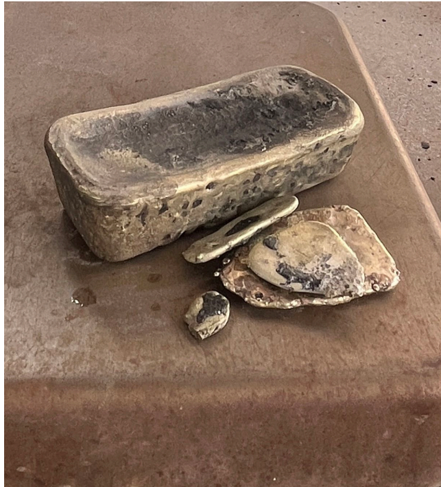
Figure 1: Doré poured at GGPP on 3 December 2025