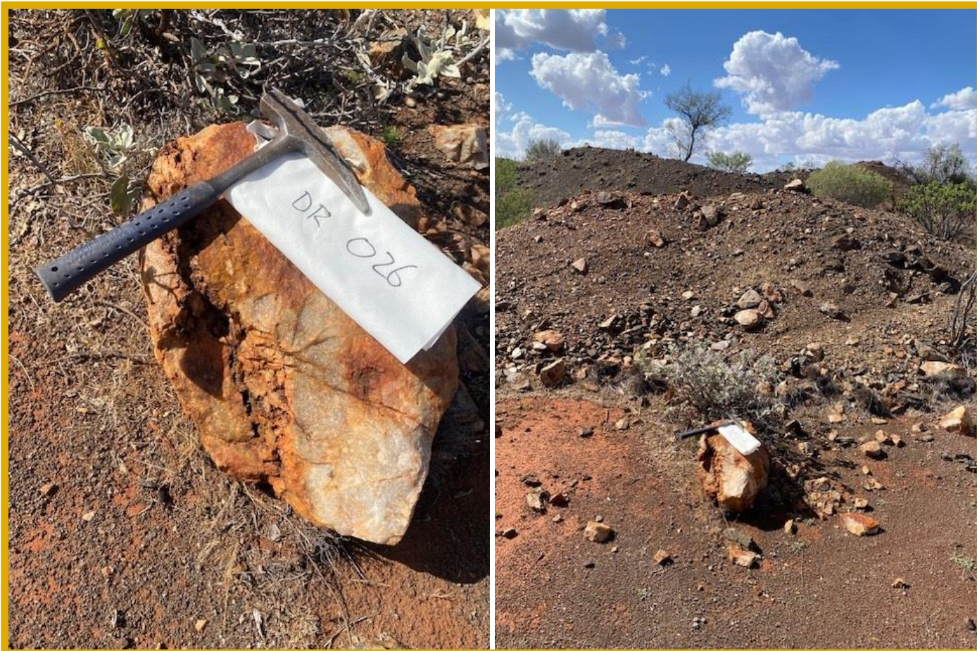
Photo 1 & 2. Sample DR026 – 25.8g/t Au. Quartz stockpile Armstrong Historic Gold Mine.

The absence of any historic systematic soil geochemistry sampling over the broader project area gives the Company's field teams a strong opportunity to define additional drill targets at Armstrong through geochemistry in the lead up to drilling next year, following the two standout copper and gold drilling campaigns at Mt Boggola and Blue Devil. We look forward to continually delivering news flow over the coming weeks."