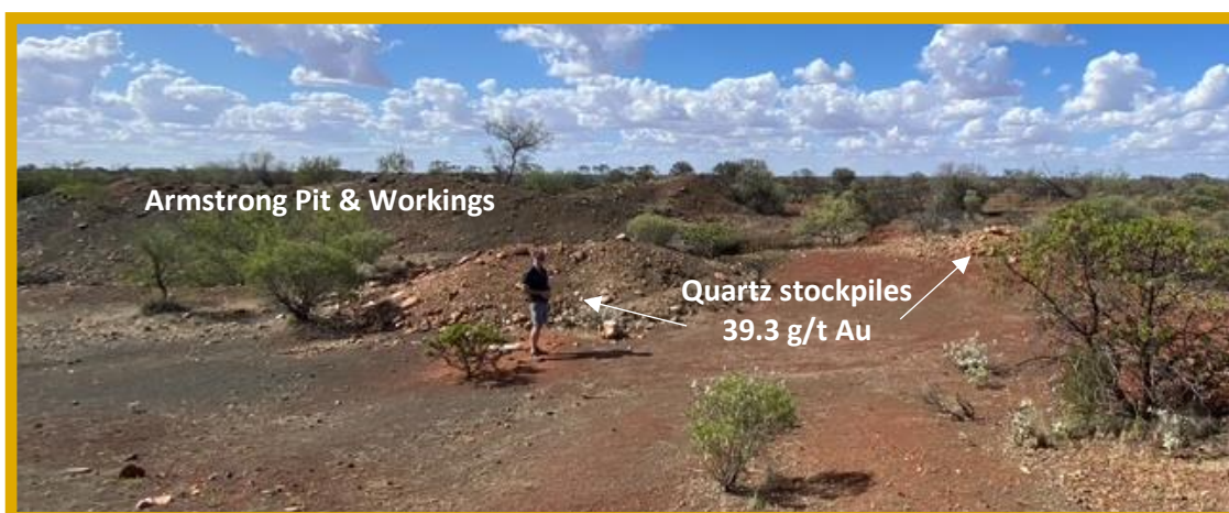
Photo 3. Armstrong Prospect pit south facing, with several quartz stockpiles recently sampled.