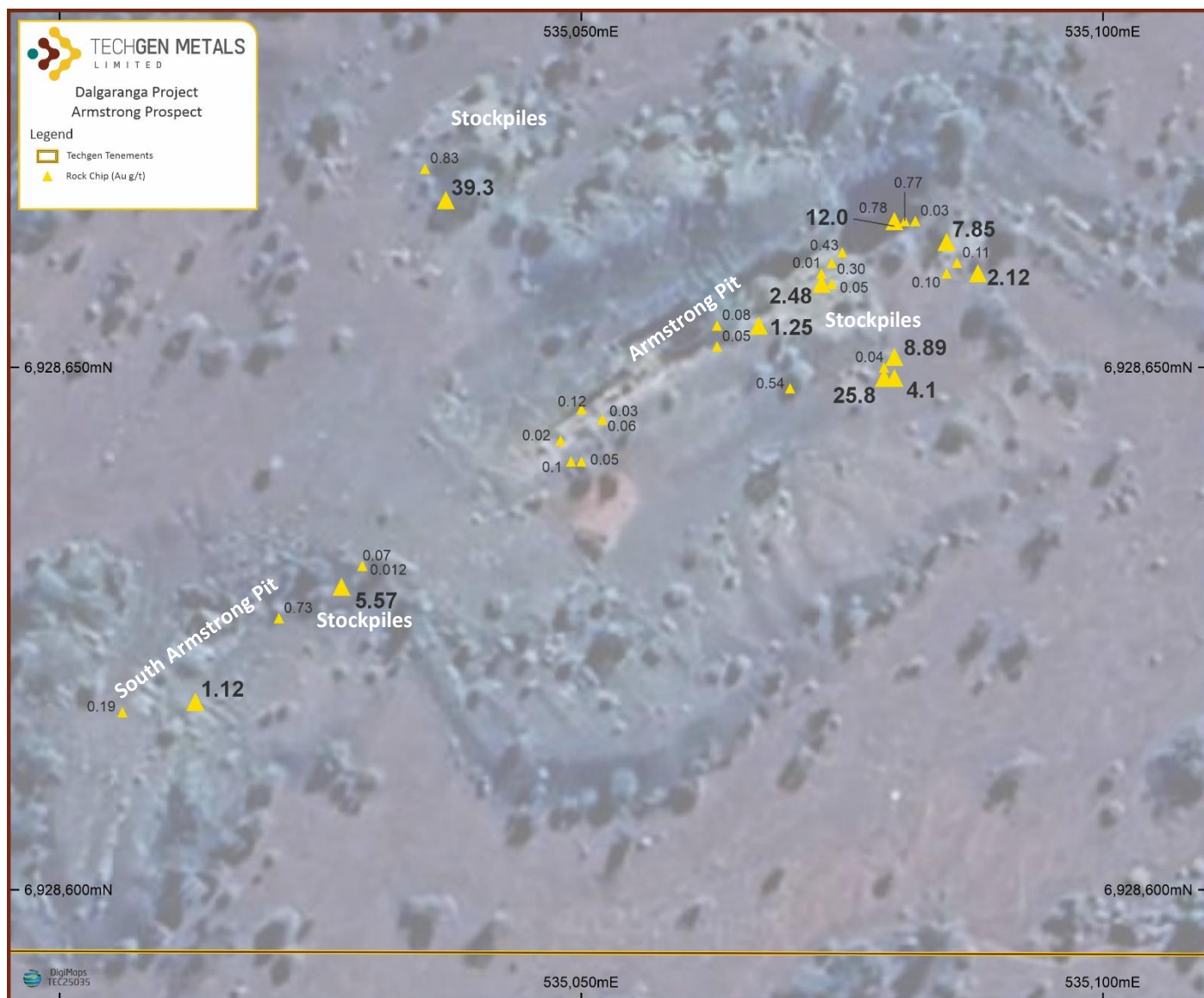
Figure 2: Location of E59/3024 & E59/3025 Dalgara Project over magnetics.