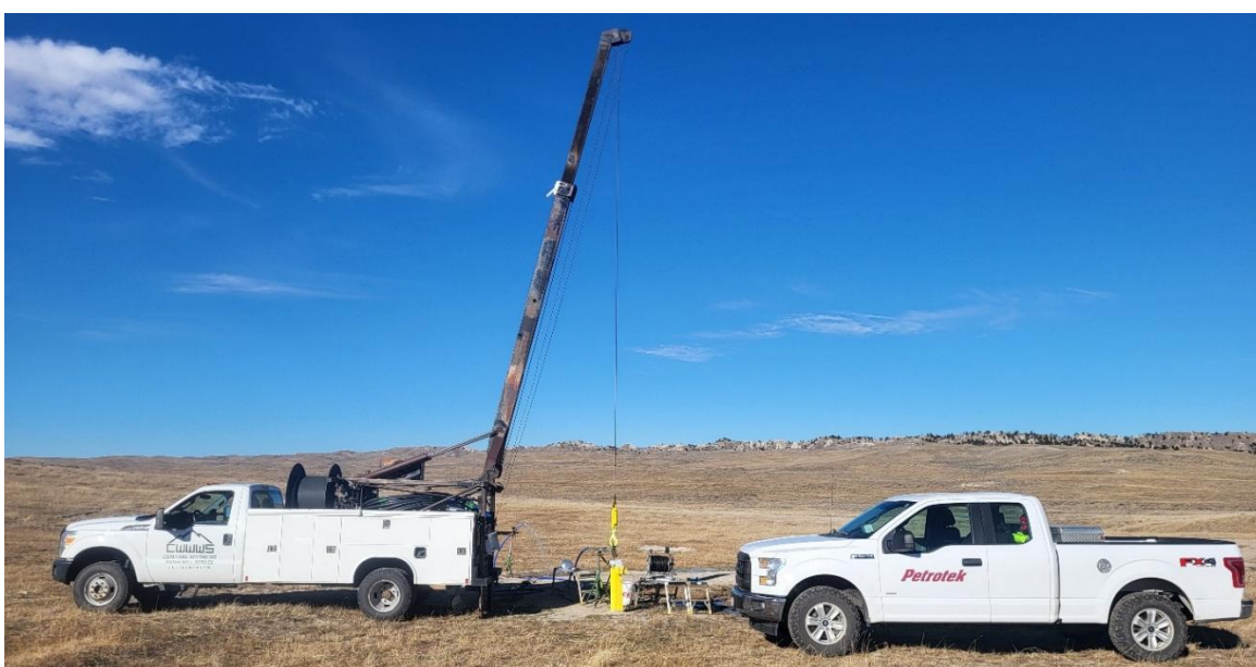
FIGURE 1: FIGURE 1: PETROTEK AND WYOMING WATER SERVICES CONDUCTING HYDROGEOLOGIC TESTING AT LO HERMA, POWDER RIVER BASIN, WYOMING

The testing progressed efficiently and successfully, with all wells demonstrating sustained flow rates with minimal aquifer drawdown for the full duration of the tests. These results present an important step in confirming aquifer transmissivity and supporting the project's ISR development pathway. The Company anticipates receiving Petrotek's comprehensive pump testing results and analysis before the end of the year.