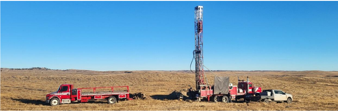
FIGURE 2: DRILL RIG IN OPERATION NORTH OF PROPOSED MINE UNIT 2, LO HERMA ISR URANIUM PROJECT, SOUTHERN POWDER RIVER BASIN, WYOMING

The ongoing drilling program is designed to expand the existing resource base and improve geological confidence ahead of the planned 2026 Mineral Resource Estimate update.