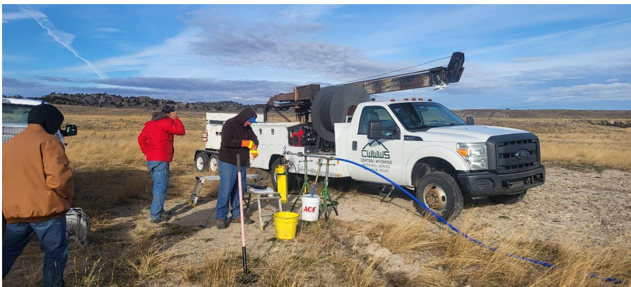
FIGURE 1: PETROTEK CONDUCTING HYDROGEOLOGICAL TESTING AT LO HERMA

This testing is running concurrently with Phase 1 of the resource development drilling campaign which is progressing well and is now past the halfway point of the resource expansion program. Drilling results are expected by the end of 2026. The hydrogeological testing fieldwork program is expected to be complete during the week commencing November 24 th , with results anticipated before the end of 2026.