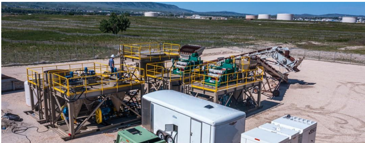
Figure 1. Gen 8 modular HPSA components

Mandrake Resources Limited (ASX: MAN) (Mandrake or the Company) is pleased to announce the signing of a non-binding Term Sheet with DISA Technologies Inc. (DISA) to evaluate the potential use of DISA's patented High Pressure Slurry Ablation (HPSA) technology to treat and recover uranium and other critical minerals from abandoned mine waste (AMW) material located within Mandrake's 100%-owned 93,755 acre (approximately 379 km 2 ) Utah Project.