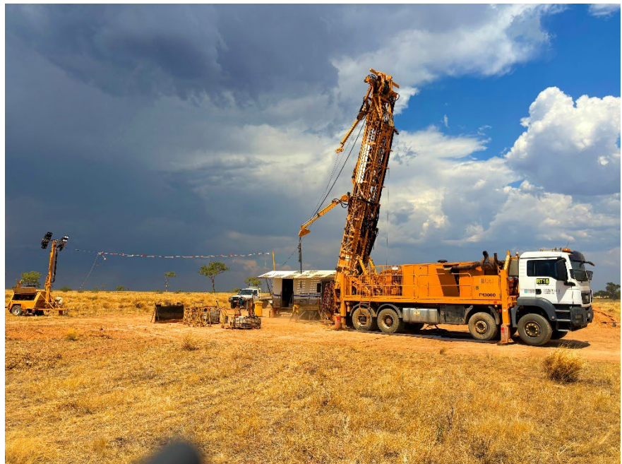
Figure 1. Rig on site at HMBRDD006