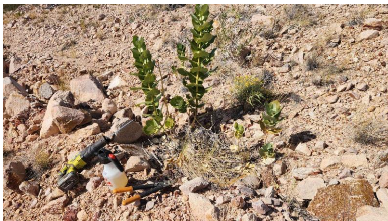
Picture 2: Calotropis (declared weed) identified during Agreco survey.

In accordance with Northern Minerals Mining Proposal (for the Pilot Plant) commitments, a work program to survey, map and treat weed infestations was completed during the quarter.