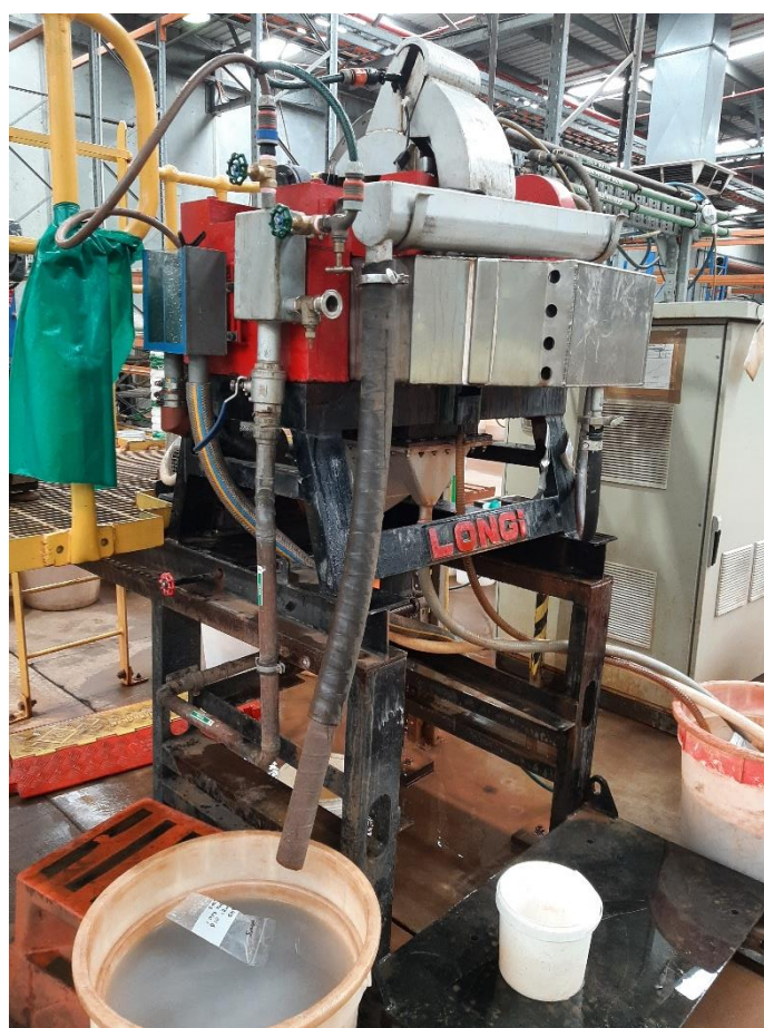
Picture 4: Laboratory scale vertical magnetic separation of the Dazzler material.

Any adjustments to the mine plan or project economics will depend on positive metallurgical results, an updated MRE and mining studies. If successful, Dazzler's inclusion could further enhance early project performance. However, final decisions await completion and integration of technical assessments.