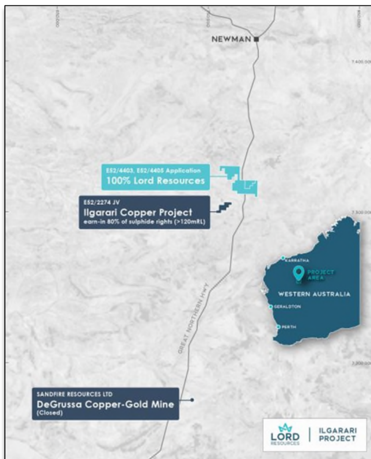
Figure 3 Ilgarari Copper Project's location is 110km south of Newman, in Western Australia.