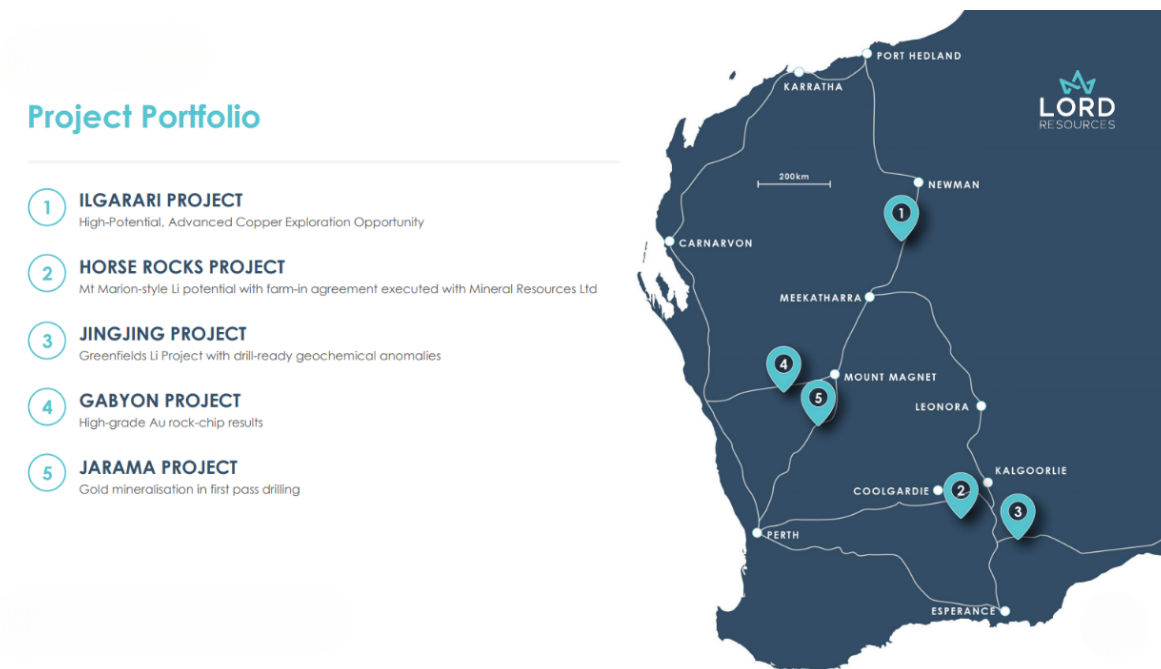
Figure 3 Lord Resources Ltd portfolio of projects

Lord Resources Ltd (ASX: LRD) is an exploration company with a highly prospective portfolio of future facing metals located within Western Australia including projects providing exposure to copper, gold and lithium.