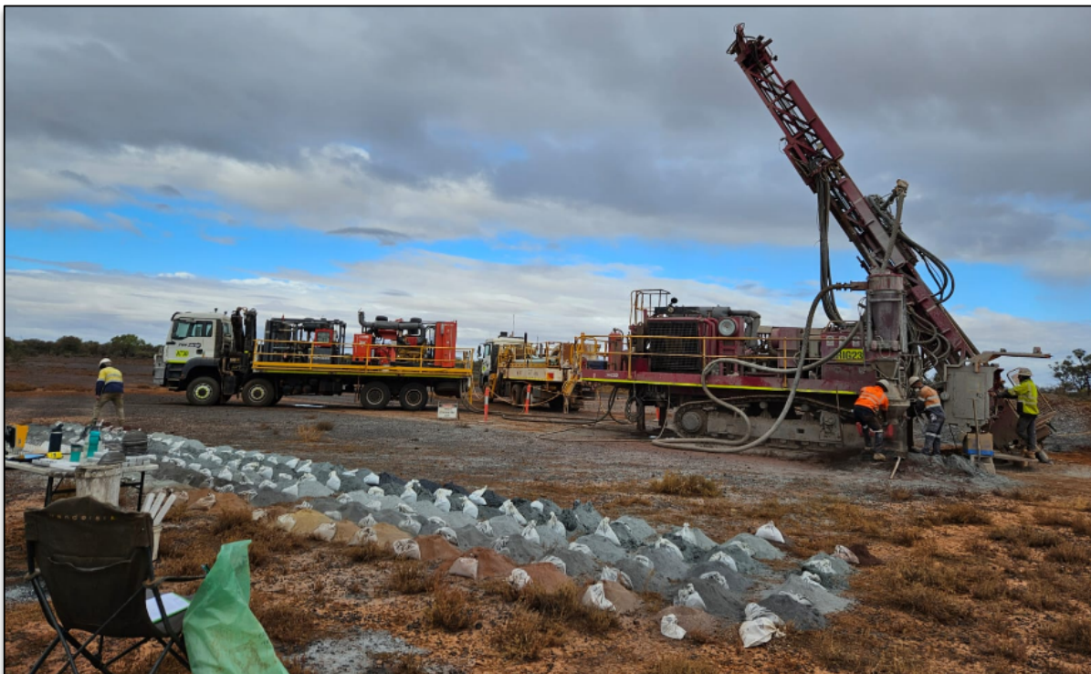
Figure 1 Topdrill RC rig drilling at the Ilgarari Copper Project.

Subsequent to the end of the quarter, Lord announced the results from phase one of the September drilling program, finalising and reporting assay results (refer Figure 2). 1