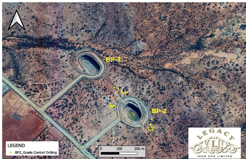
Figure 3 Location map of Grade Control & Resource Definition Drilling at Blue Peter 2