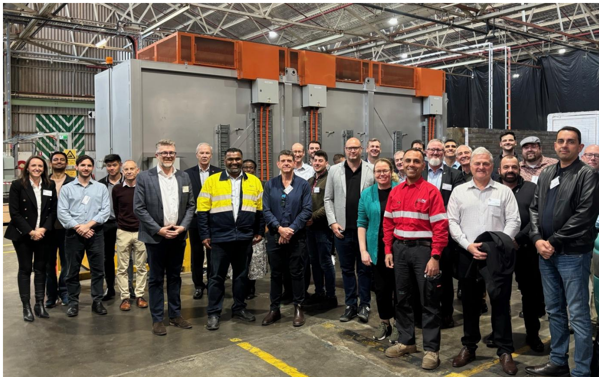
Figure 2 SA Hydrogen Technology Cluster tour group at 1414 Degrees' Tonsley facility