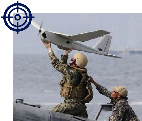
Defence Industry Suppliers

We have chosen priority verticals to pursue while continuing to grow government and major accounts.