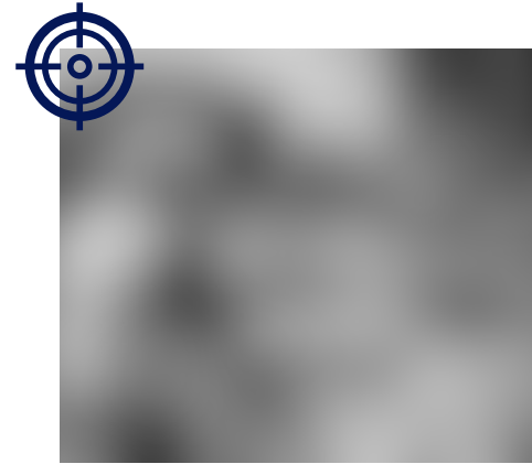
Target Vertical 3