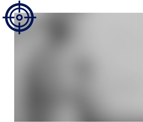
Target Vertical 2