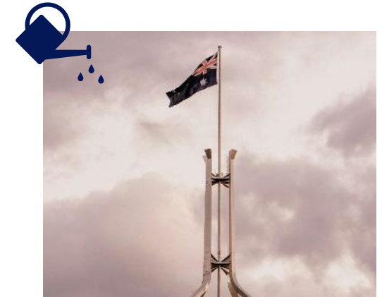
Federal & State Government and major accounts