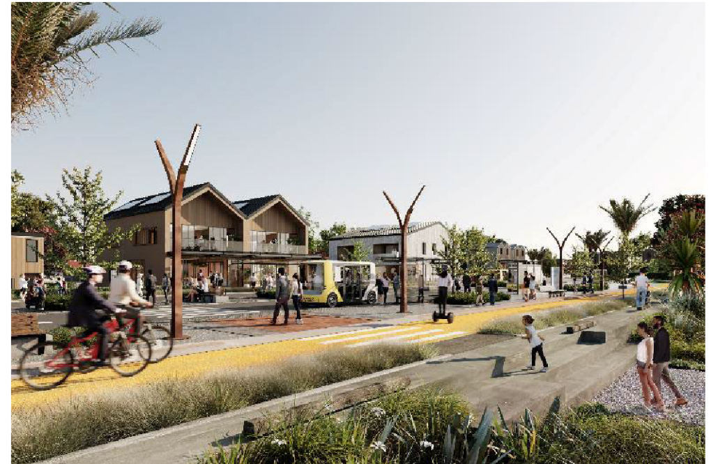
Sunfield, Auckland (artist impression)