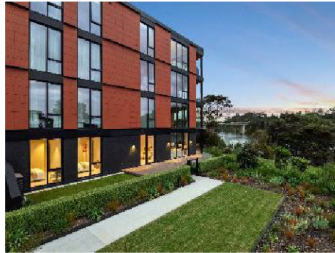
Launch Bay, Hobsonville Point