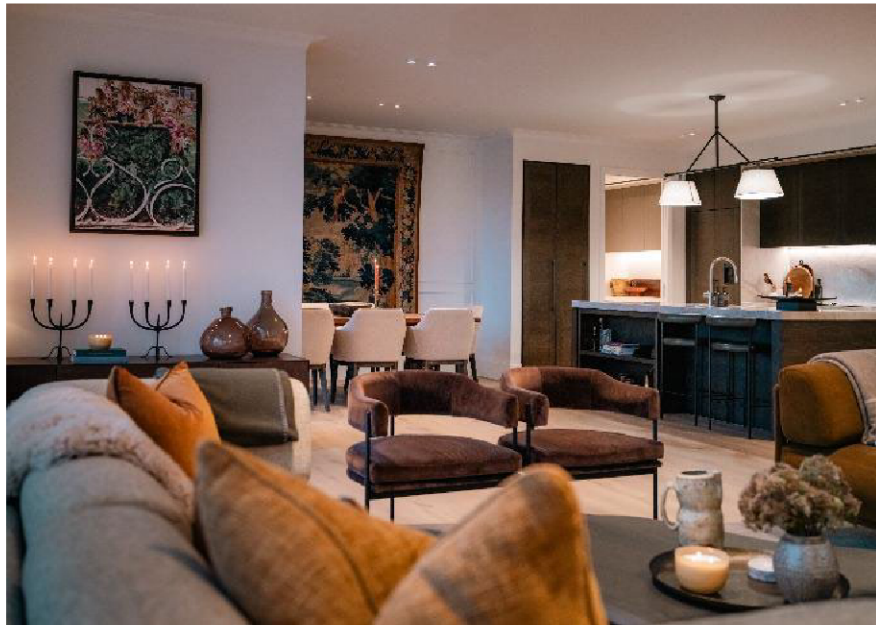
Residents' Lounge, Northbrook Wānaka