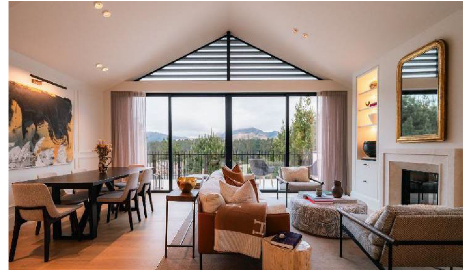
Three-bedroom Residence, Northbrook Wānaka