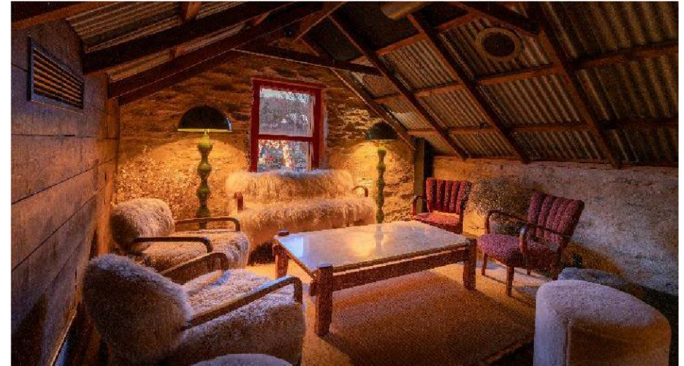
The Loft, Ayrburn