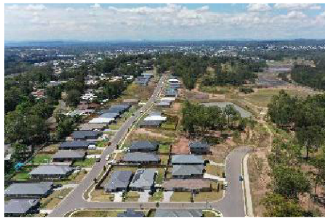
North Ridge, Cessnock