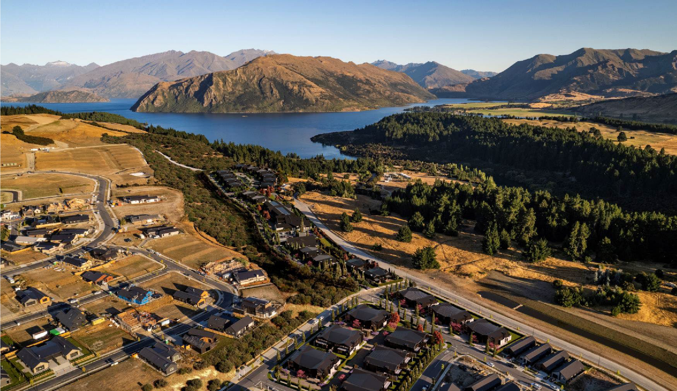
Northbrook Wanaka, Northlake