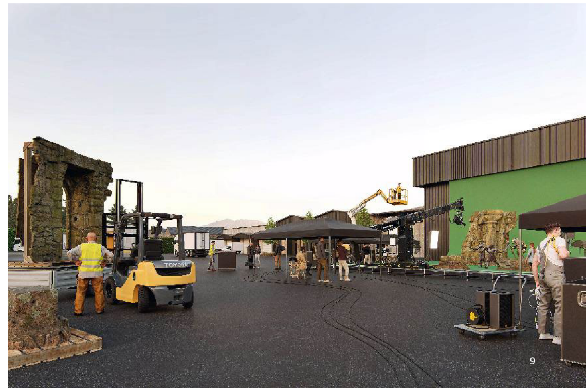
Screen Hub, Ayrburn (artist impression)