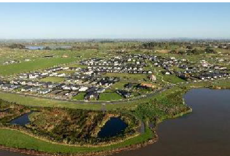
Lakeside, Te Kauwhata