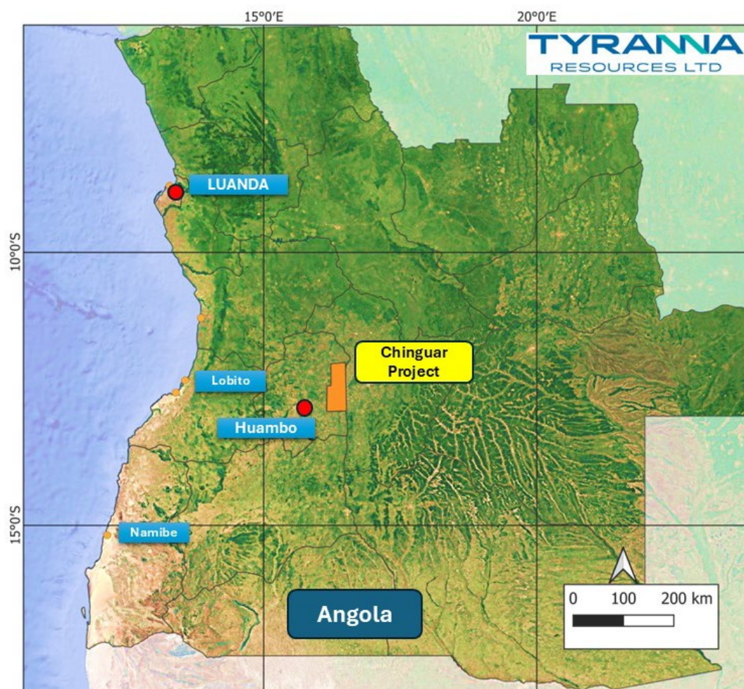
Figure 1. Location of the Chinguar Gold Project, approximately 50km northeast of Huambo. With an area of 3,342km 2 , the Project is approximately 100km long and between 30 and 40km wide.

The Chinguar Gold Project (" Project ") comprises a single, very large, granted Prospection Title 1 with an area of 3,342km 2 , located 50km northeast of Huambo, Angola's second largest city, (Figure 1).