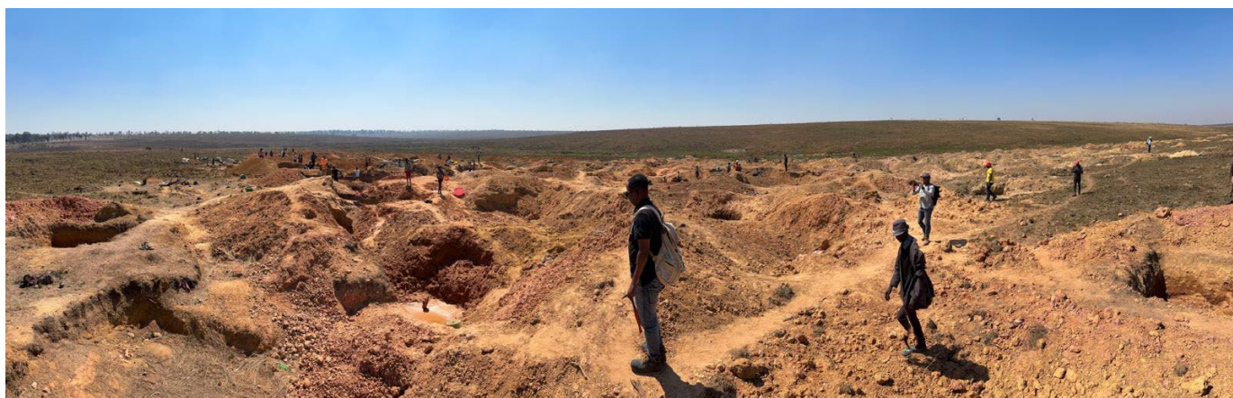
Figure 3. Panorama of the Consito Alto garimpo workings in laterite. The workings extend for over 450m.

Targets generated will then be progressively drilled.