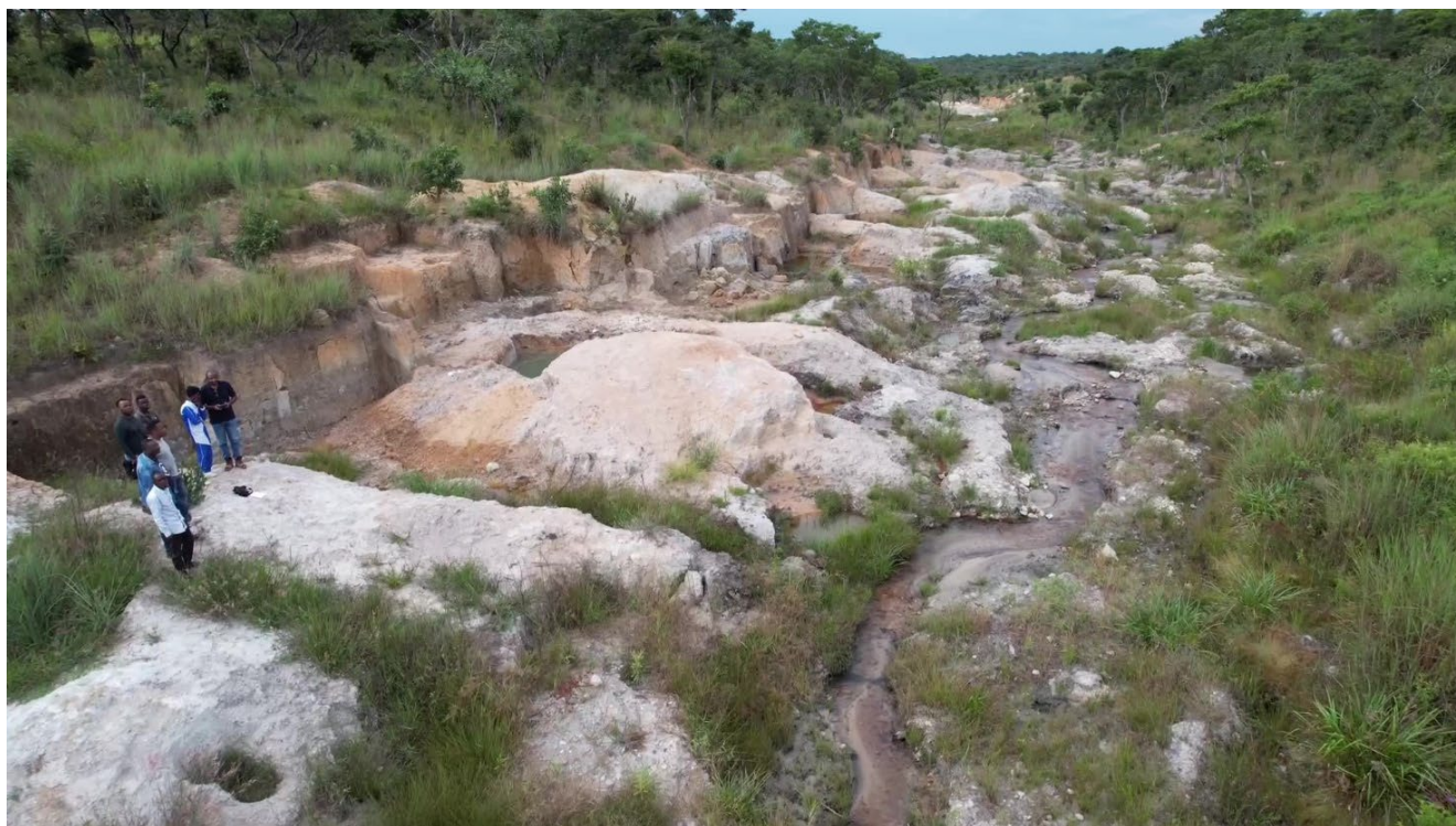
Figure 4. A seasonal river at Longundo . Garimpo pits are dug to access gold-mineralised gravel beds at the base of recent alluvial sediments