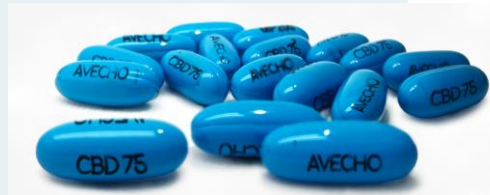
Avecho's TPM CBD capsule