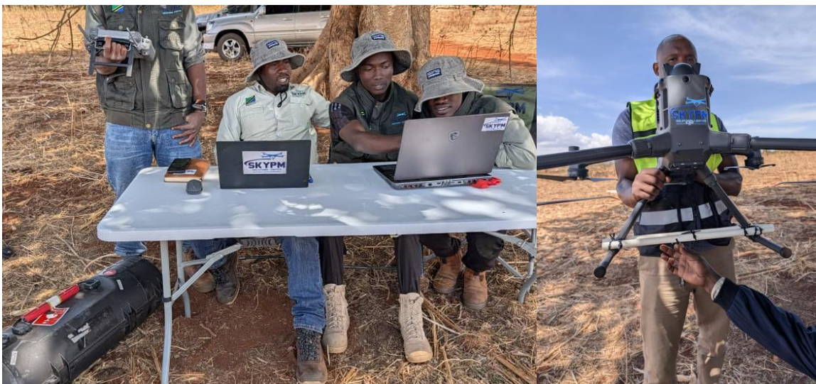
Figure 2 SkyPM Solutions Field Testing

This announcement has been approved for release by the Board.