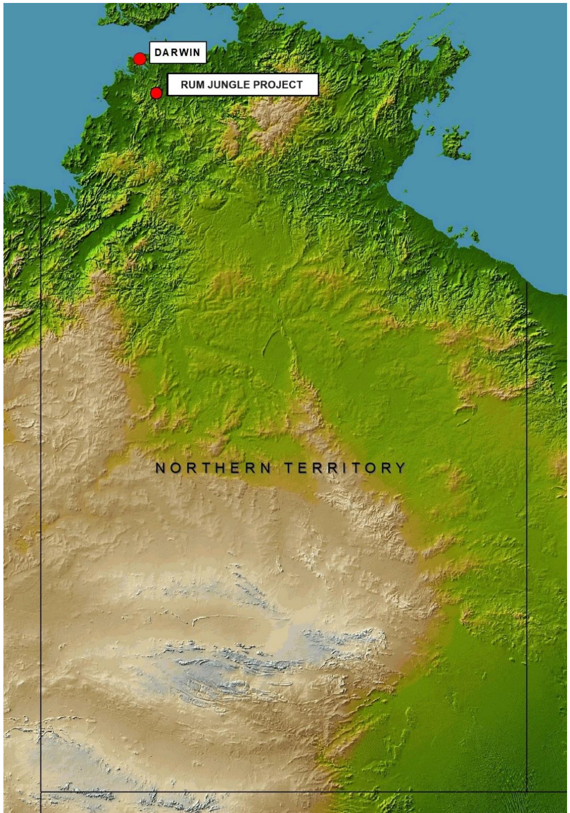
Figure 2 Location of Rum Jungle Project

Mt. Elephant (Ashburton, WA) Gold, Copper