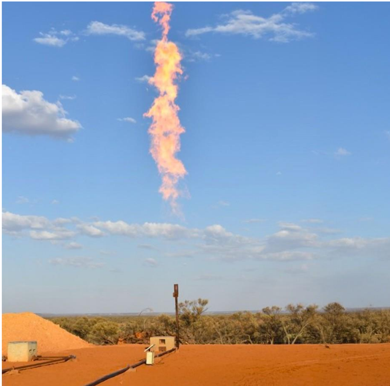
Image of Flare on Tammara 2

The targets are Cooper Basin Permian saturated tight sands comprising the Patchawarra, Toolachee and Arrabury sandstones. The geology is defined by source rock maturity, with the thickest section located in ATP 927.