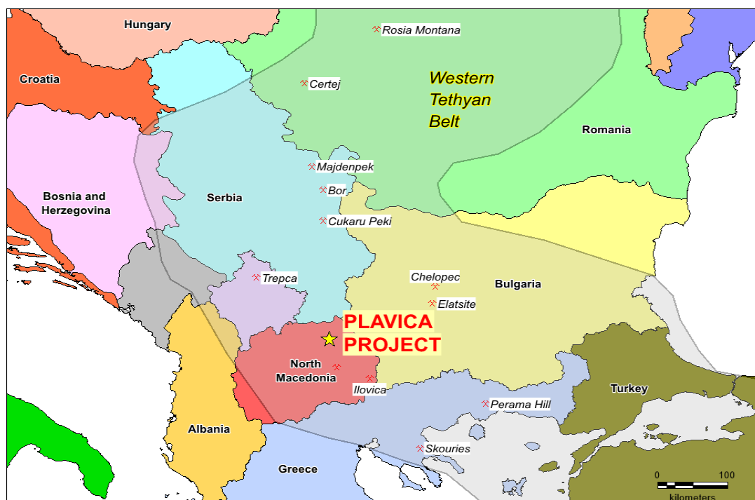
Figure 1 (above) Location of the Plavica Gold-Copper-Silver Project, North Macedonia